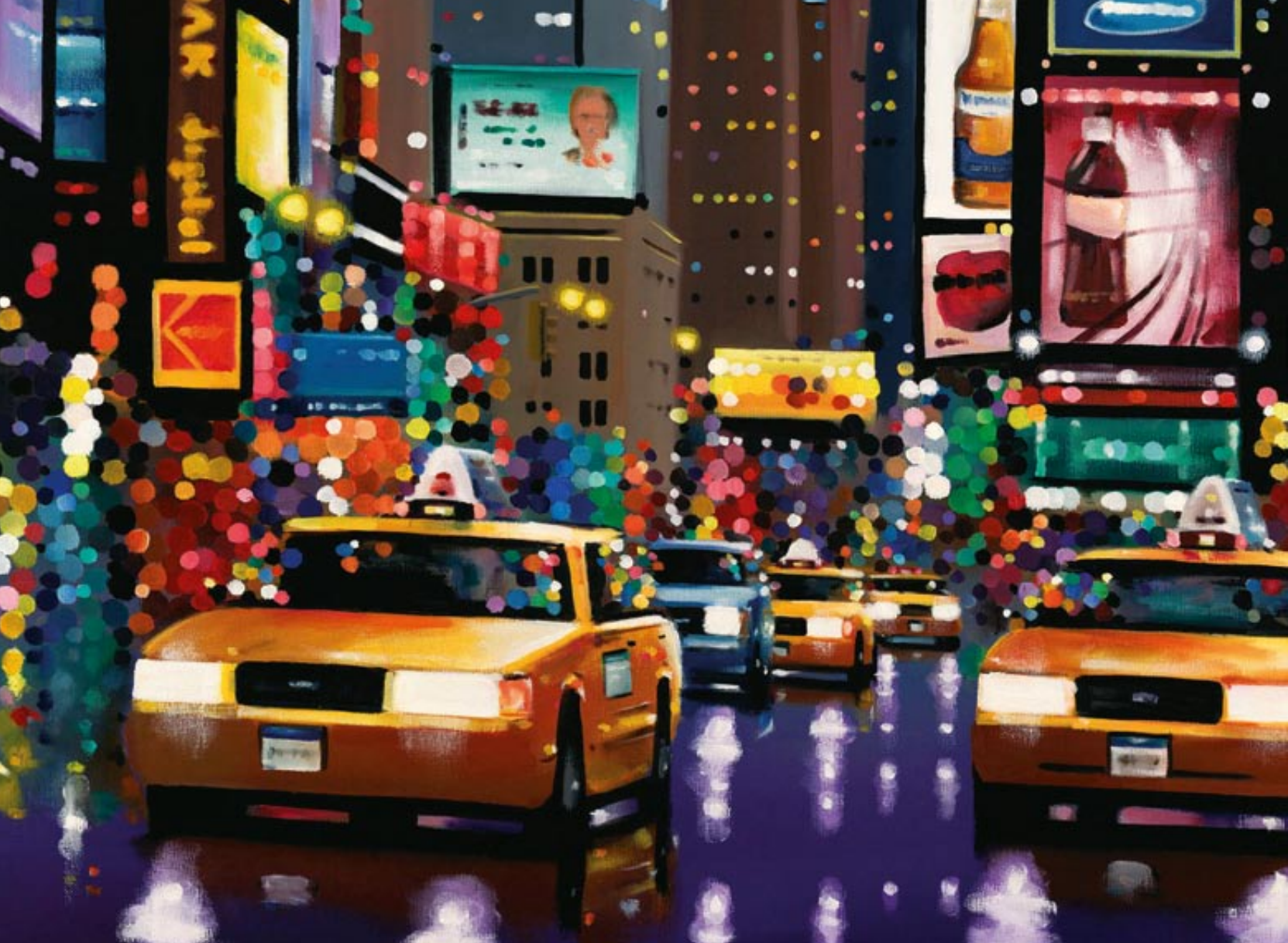
↑ I Love NY Canvas edition of 150 Image 34" x 34" Framed £635